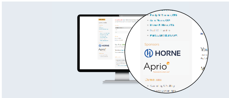
Example of website acknowledgment.

Exhibitor Mania is our way of encouraging all attendees to engage with our exhibitors.