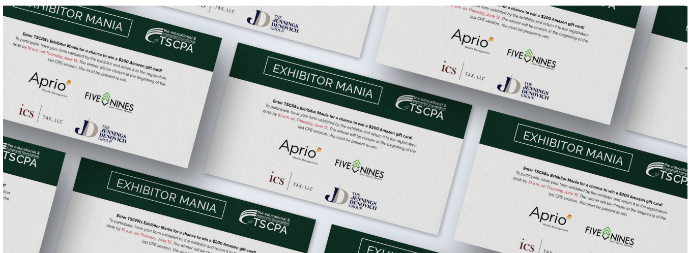
Example of Exhibitor Mania.